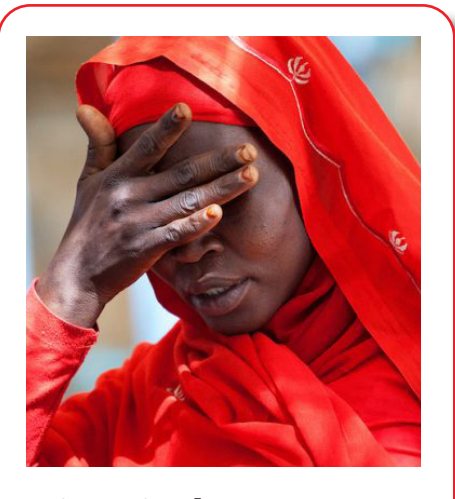
Historical Memory: Constructing a Memorial to Genocide

Provide students with the opportunity to express their own perspectives through knowledge construction, working in small groups to build community.